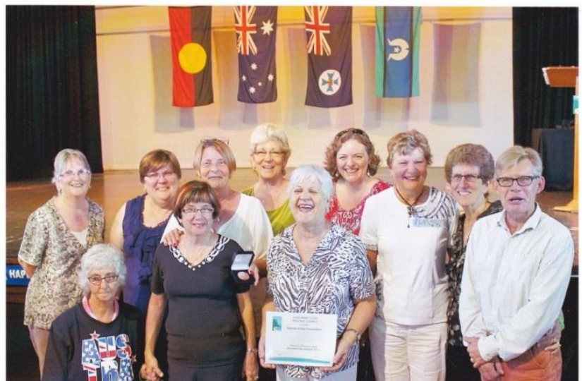
Innisfail FoF members take centre stage at the Australia Day Awards ceremony.

"I am very proud of my bunch," she said.