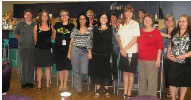
The Department of Human Services Centrelink Call Cairns team

The Department of Human Services Centrelink Call Cairns have a dedicated group of staff who promote increased awareness of special needs groups and building purposeful relationships with the local community. This group organises fundraising events throughout the year to support charities on key event days and to provide donations at the end of the year to 4 local organisations nominated by the staff. $750 was donated to the Far North Queensland Hospital Foundation. The Foundation is very pleased to be selected as one of the lucky recipients of the Centrelink team's efforts.