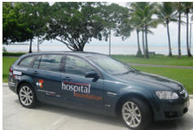
The Foundation's new vehicle

putting the pieces together for a healthier north